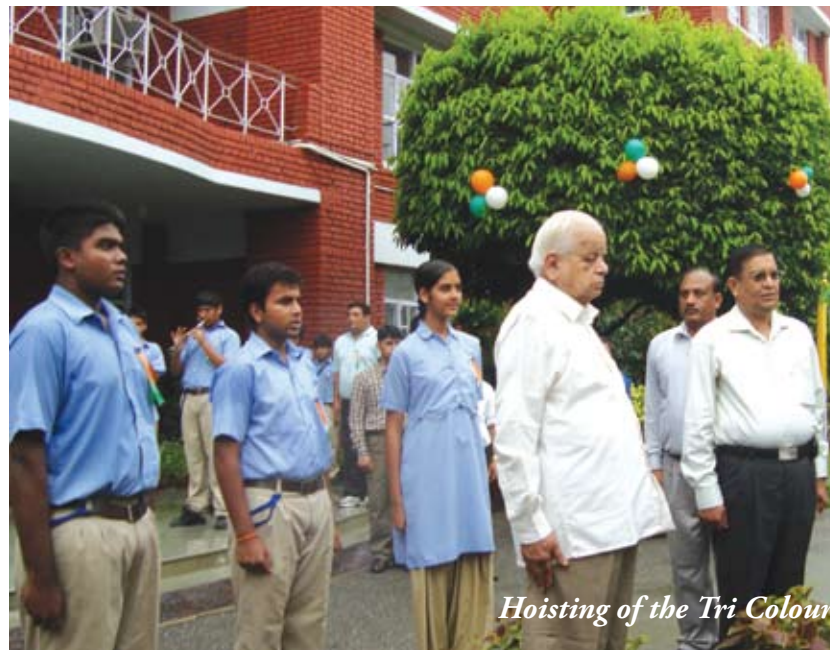
Hoisting of the Tri Colour

He talked about the various challenges faced by the country throughout the years since its independence. He further mentioned the various