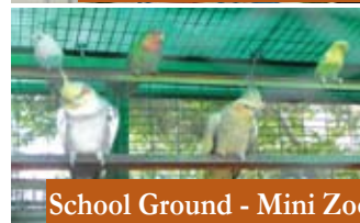
School Ground - Mini Zoo