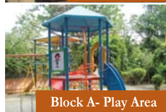
Block A- Play Area